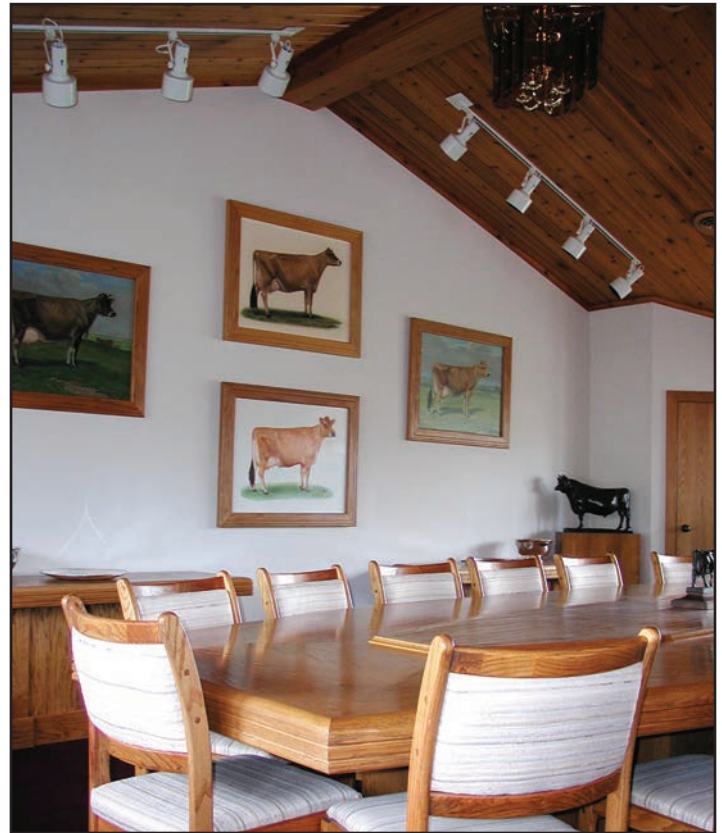
CONFERENCE ROOM AT AJCA-NAJ OFFICES

4:30 p.m. All assemble at the Wells Barn for social hour, dinner and program.