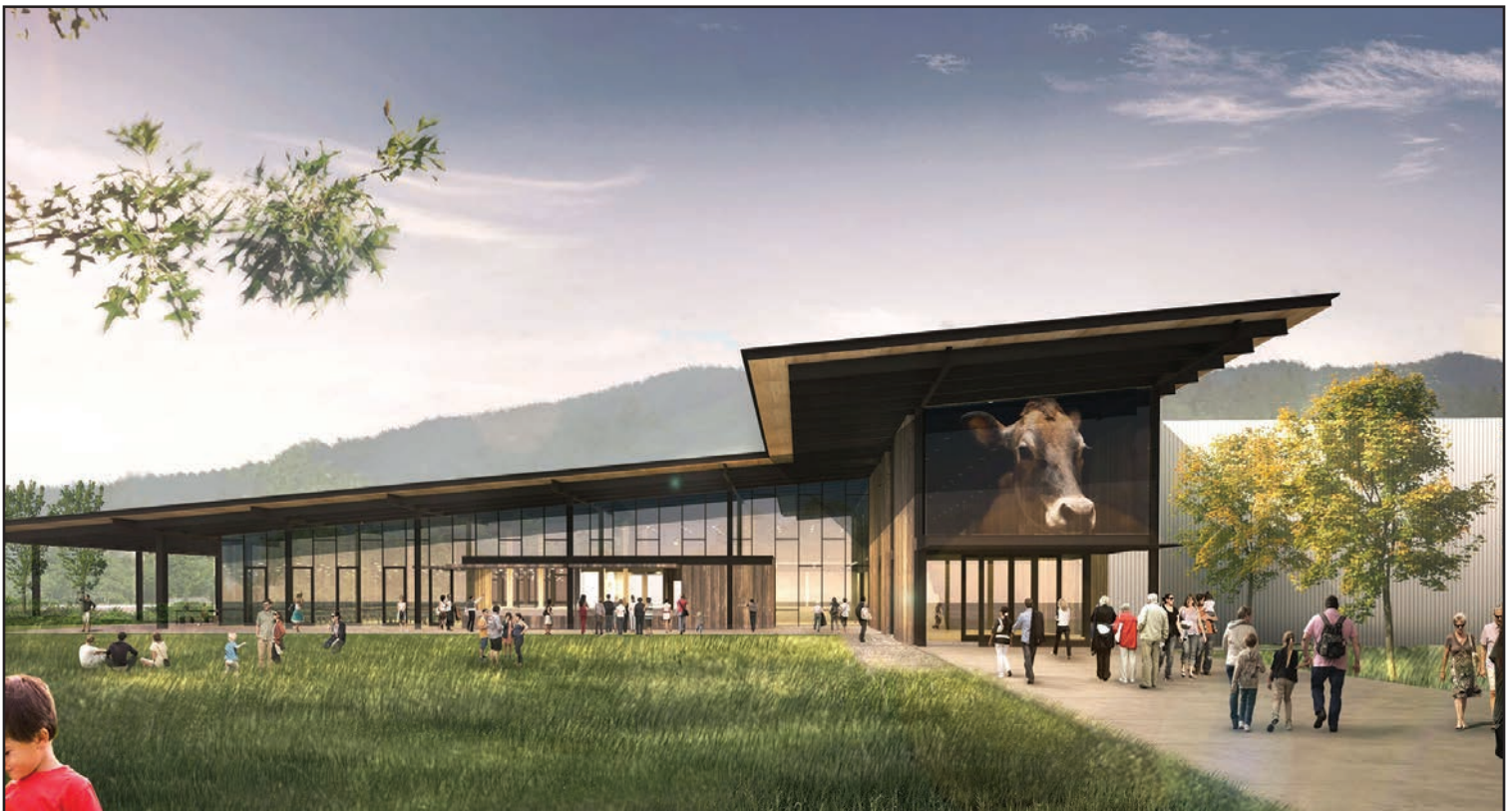
ARCHITECTURAL RENDERING OF THE VISITOR CENTER UNDER CONSTRUCTION AT TILLAMOOK CHEESE

NOT INCLUDED: Air Transportation from Portland to Columbus.